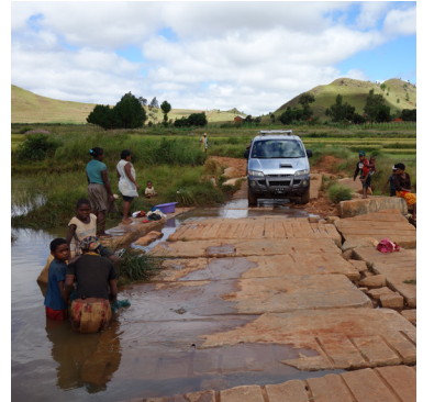
AFGROLAND Project in Madagascar.

The Forum supports multi-national and transdisciplinary collaborative research, bringing together natural sciences, social sciences, and the humanities, as well as stakeholders in co-creating the knowledge and solutions for sustainable development that benefit society. The Forum aims for its global efforts to be truly solutions-oriented, thereby contributing to the United Nation's Sustainable Development Goals in the context of Global Change.