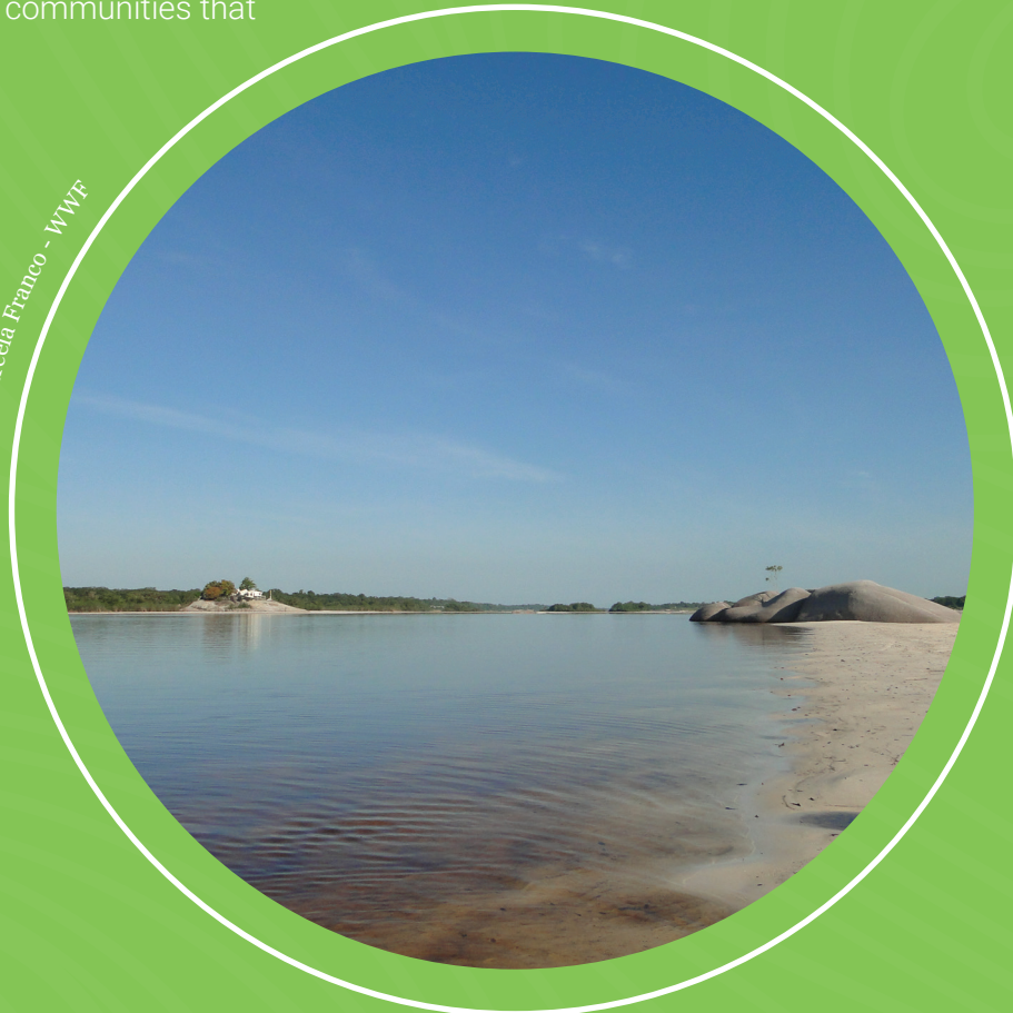
The banks of the Atabapo River.