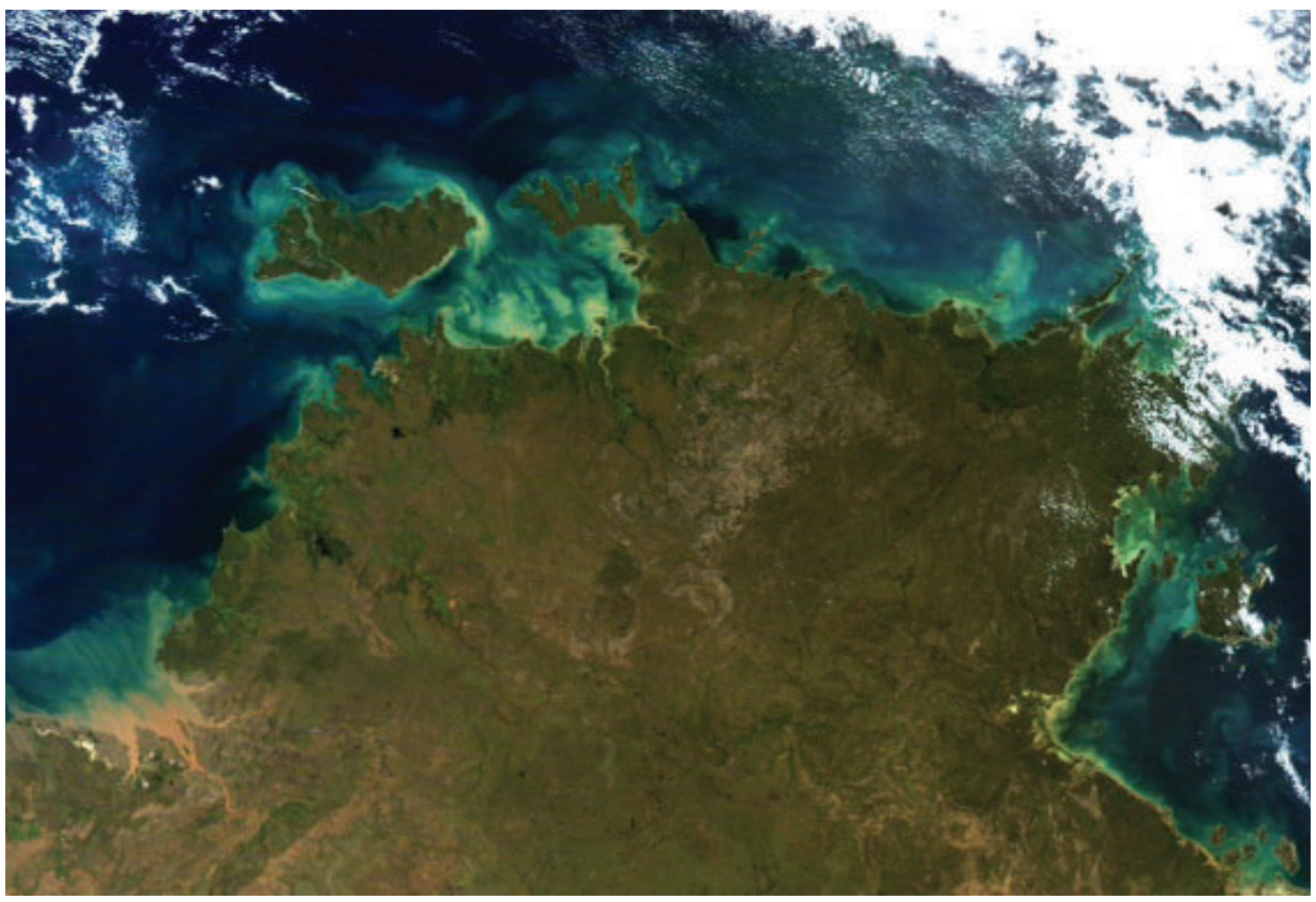
Waterways and catchments of the Top End have significant natural and cultural resources.

waterways as natural reference points. Darwin Harbour is unique in that few tropical cities of Southeast Asia have stable economies and governments, sophisticated scientific capabilities and low population densities. Innovative approaches for dealing with coastal issues can be achieved in this setting.