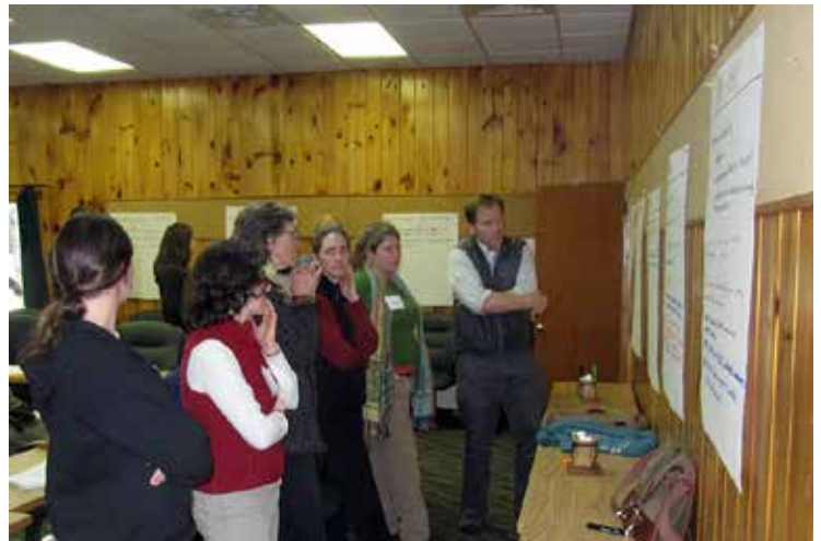
Participants at a Wildlife Conservation Society lowland boreal climate change planning workshop.