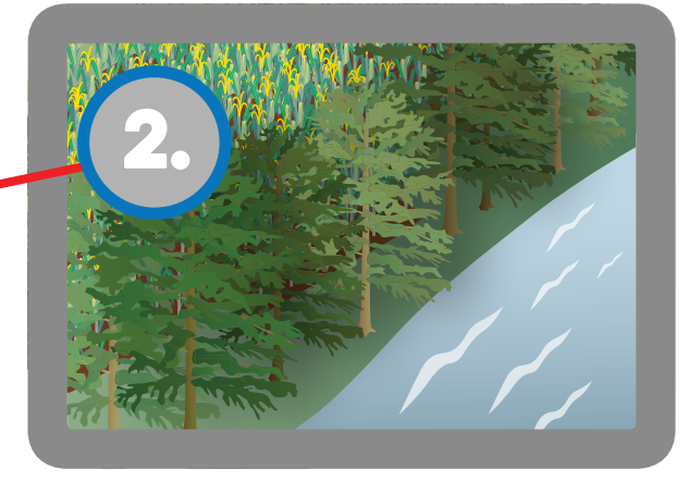
Identify the specific credits or restoration projects you would like to invest in.