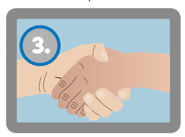
Negotiate the terms of the purchase with the credit seller.