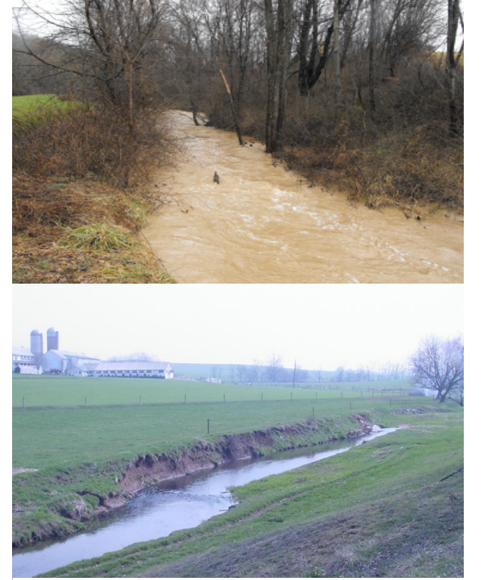
Impairments in Linganore Creek in Maryland (top) and Little Conestoga Creek in Pennsylvania (bottom) caused by altered geomorphology and high nutrients from sedimentation and agricultural runoff.

monitoring of stage or discharge, which is best coupled with rainfall monitoring.