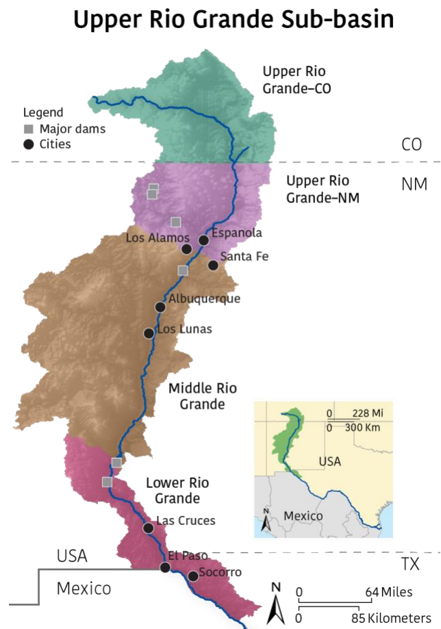
Figure 1: Four sub-regions of the Upper Rio Grande River Watershed.

With the initial workshops complete, the project team evaluated data availability for each proposed indicator. This included many calls and meetings to work on data issues and establish thresholds and scoring. A webinar was held in November 2021 to present the preliminary scores and further refine indicators and thresholds.