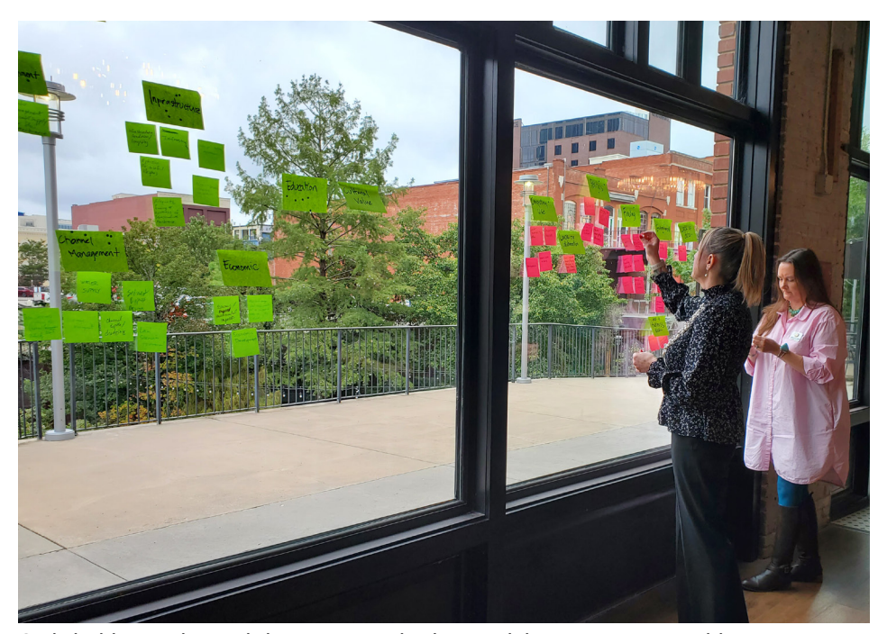
Stakeholders at the workshop organized values and threats into actionable categories.

These proposed mechanisms of action aim to improve knowledge and public awareness about the importance of inland navigation in the Arkansas and Red Rivers basin. By addressing these challenges, stakeholders can work towards the sustainable management and preservation of these vital waterways.