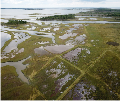
Salt marshes like this one are migrating inland as sea levels rise.

Shoreline and marsh restoration techniques include beach replenishment, waterway dredging, upland disposal, dredge disposal islands, shoreline bulkheading, and living shorelines. Organizations including Audubon Mid Atlantic, the Nature Conservancy, the U.S. Fish and Wildlife Service, Assateague Island National Seashore, and MCBP are exploring new techniques and funding mechanisms to mitigate the effects of sea level rise. Techniques such as beneficial dredge use, dredging for restoration, shallow runnels, ditch remediation, and thin layer placement are planned throughout the watershed.