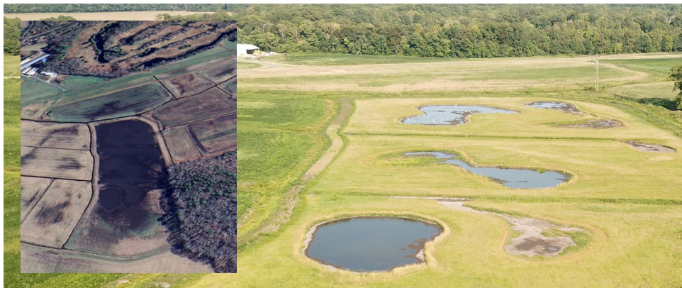
The inset photo above shows an agricultural field prior to restoration. Once reclaimed as wetland, as in the larger photo, the land improves water quality, provides habitat, and re-establishes hydrology.

This 15-acre agriculture field (inset below) was difficult to crop in many years due to its very wet nature. It was converted to wetlands (below) with funding through the Agriculture Conservation Easement Program and the Infrastructure Investment and Jobs Act. Conversions such as these compensate landowners for loss of production, can improve water quality, provide wildlife habitat and re-establish wetland hydrology on former cropland. Some of the birds that have been observed feeding or loafing in the shallow pools include great egrets, snowy egrets, greater yellowlegs, glossy ibis, white ibis, and willets. In fact the roseate spoonbill, a first for Worcester County, was spotted in one of these ponds. This bright pink bird, whose range is southeastern US, was a very unusual but welcome visitor to the newly restored habitat.