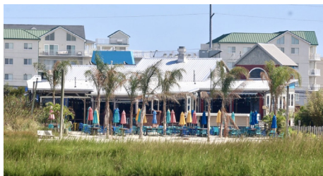
Macky's Bayside Bar and Grill is located in Ocean City, Maryland.

Just west of Macky's Bayside Bar & Grill is Reedy Island, the only breeding island for laughing gulls in Maryland and a historic breeding ground for three state-listed endangered species: common and royal terns and the iconic black skimmer. Since 2022, Macky's has played a critical role in helping us restore and monitor part of a historic beach on Reedy Island for terns. They didn't hesitate to say "yes" when we asked to place 10 tons of crushed shell in their parking lot to offload onto a barge and carry it out to the location. In fact, they've supported us with just about everything we've asked—from storing a canoe for easy access to Reedy Island, to allowing our volunteers to count and rescue horseshoe crabs on their sandy beach for scientific monitoring. MCBP is grateful for their commitment to giving back to their community and supporting us in our efforts to protect and restore our watershed!