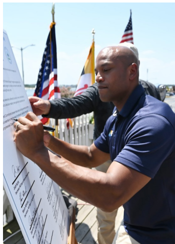
Maryland Governor Wes Moore signs the new Comprehensive Conservation and Management Plan for the Coastal Bays.

In 2024, MCBP worked tirelessly alongside our partners and community members to create a document that provides a long-term framework for action. Actions within the CCMP that inform the annual MCBP workplan specify partners responsible for successful implementation. The Plan also names periods for completion, range of potential costs, milestones for completion and performance measures to provide intended results. In addition, the CCMP includes critical components for monitoring along with strategies for Finance, Habitat Protection/Restoration, and Communication/Outreach. The EPA describes the CCMP as a critical part of the NEP model of adaptive management, suggesting a continual process of integrating new data and results. The 2025–2035 CCMP is the third of its kind since the Program began in 1996.