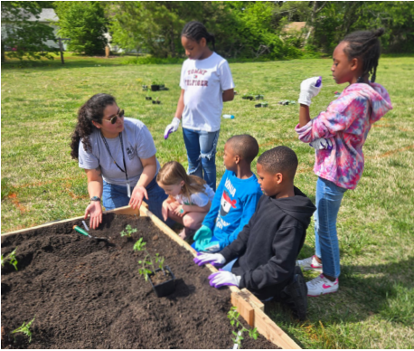
The MCBP Environmental Literacy program engages local students.