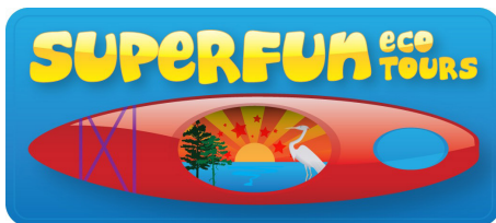
SuperFun Eco Tours is located on Assateague Island and provides kayak rentals.

Assateague Outfitters represents a truly unique and successful partnership between the Maryland Coastal Bays Program and SuperFun Eco Tours . We are grateful that SuperFun Eco Tours provides access to places in the Coastal Bays that many would otherwise not have the chance to explore. Their guided tours educate our local community and visiting tourists on the importance of our watershed and protecting our natural resources. Thanks to the dedication and vision of our partner, SuperFun Eco Tours, this collaboration continues to thrive and grow each year while providing essential financial support for MCBP projects that protect and enhance our Coastal Bays.