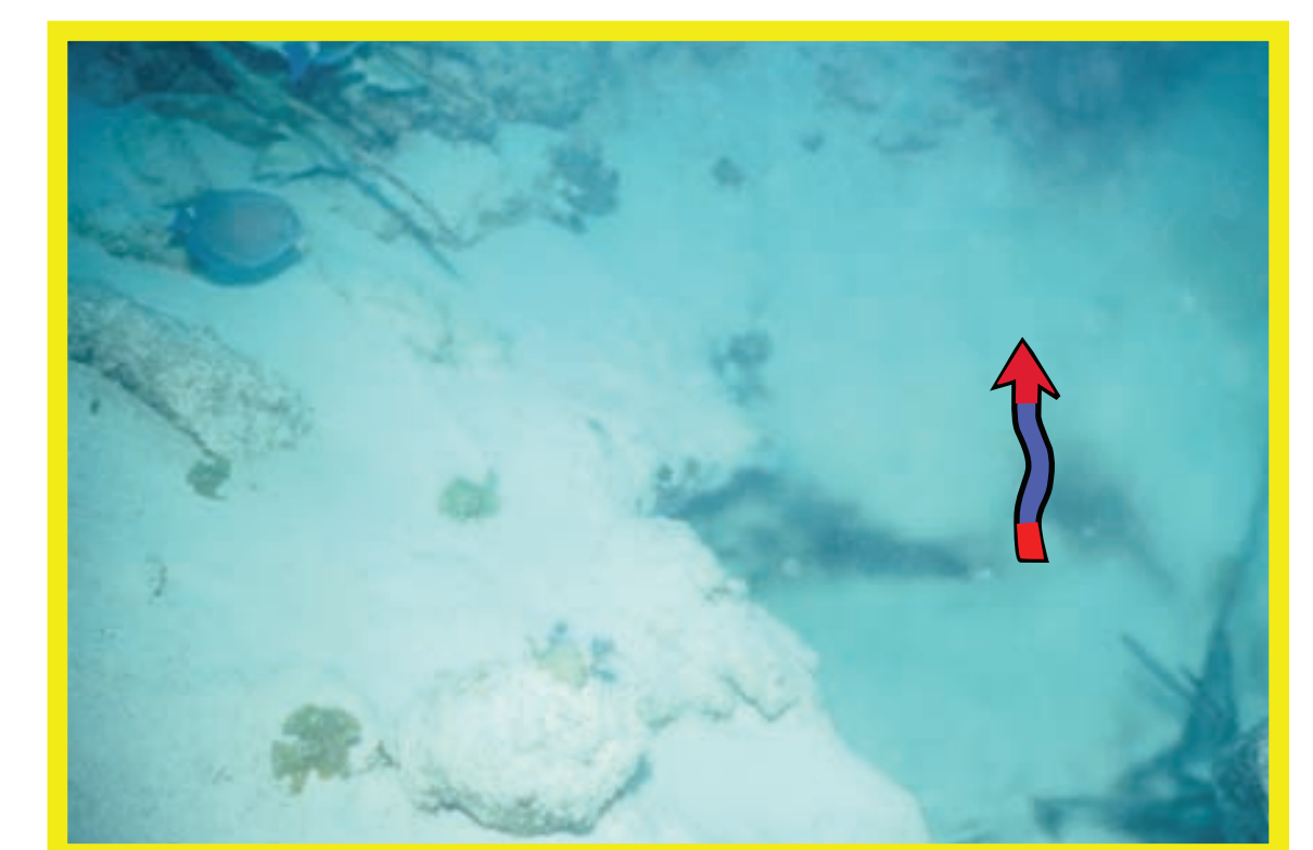
Submarine spring ( ojo de agua )—source of freshwater and nutrients to the Puerto Morelos Lagoon.