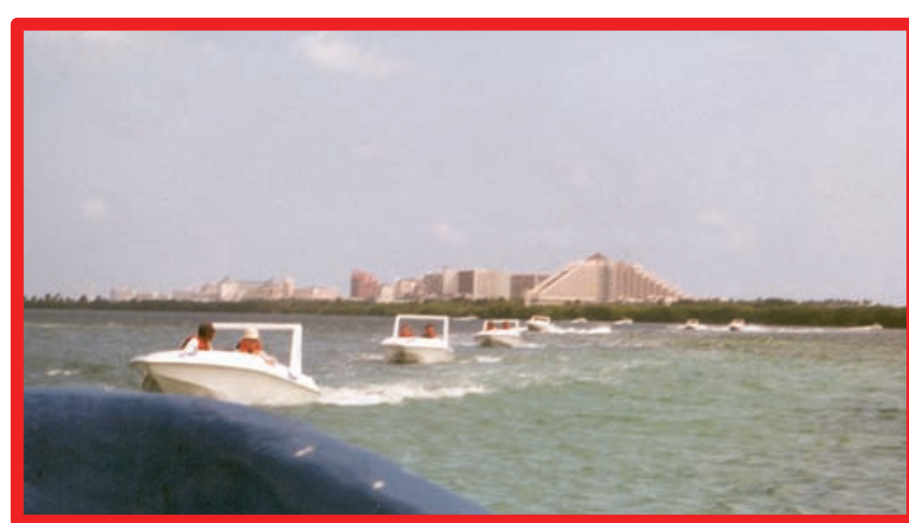
Isla Cancun (Hotel Zone) has undergone 30 years of intense development and is a source of sewage nitrogen to Nichupte Lagoon.