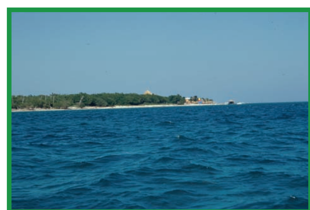
Vegetated shorelines along Puerto Morelos Lagoon are being rapidly developed.