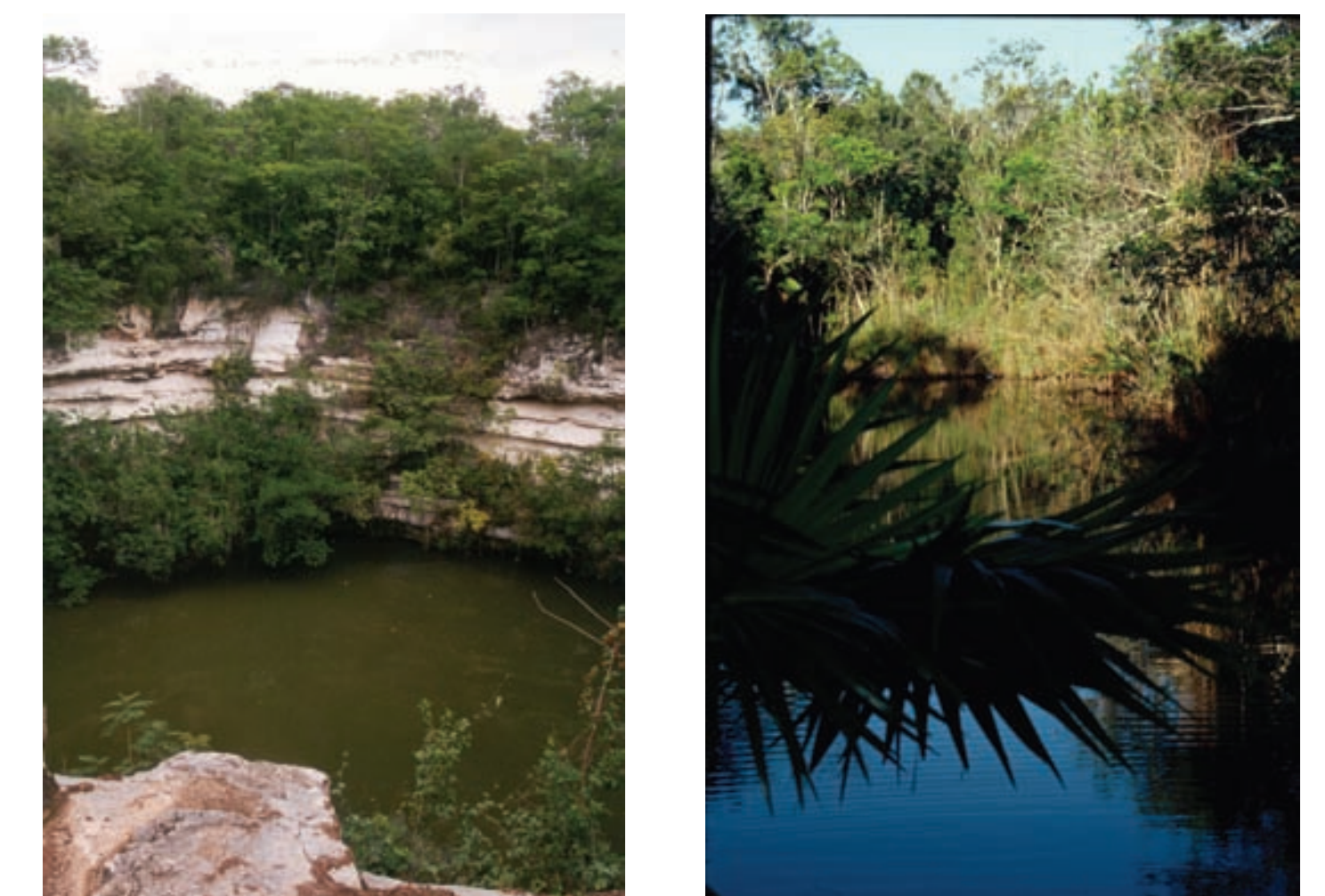
Sink holes ( cenotes ) on the Yucatan Peninsula.