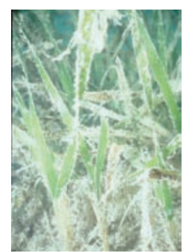
Thalassia testudinum in Nichupte Lagoon